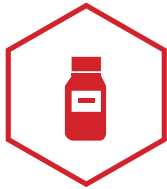
Antacid & Laxative Ingredients