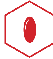
Soft Gel Capsules