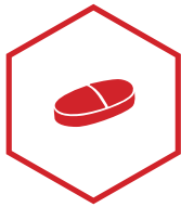
Excipients for Swallow Tablets