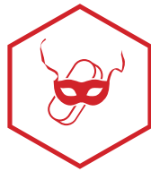
Taste Masked Actives