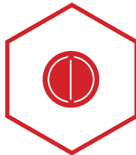
Chewable Tablets & Lozenges