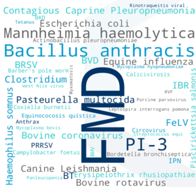
Figure 1. More common saponin adjuvanted vaccines and diseases.