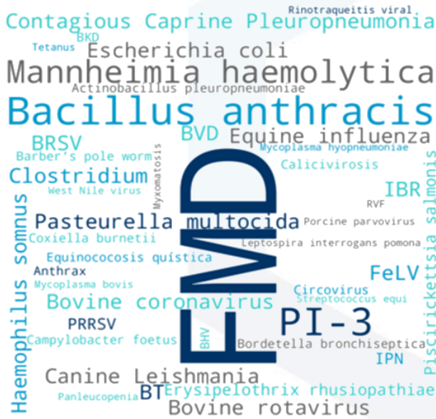
Figure 1. More common saponin adjuvanted vaccines and diseases.

VAC Saponin complete saponin profile including key immunoactive components significantly enhances antibody production, Th1 T helper response and CTL production [1] which is a widely recognized and desired protective immune response for current veterinary vaccine development against pathogens of major veterinary interest [2-6]. The saponin technology builds on the established efficacy of over 97 commercial adjuvanted vaccines.